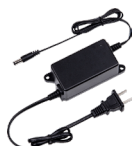
PFM320 12V 2A Power Adapter