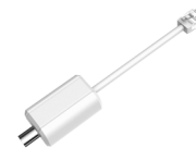
LR1002 ePoE Over Coax Converter