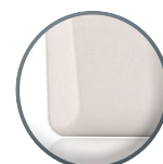
B100S-SA Silver - Metal