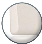
MTPADS-M Silver - Metal