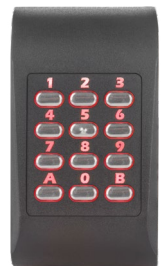
Red backlight Access denied