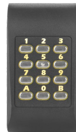
Orange backlight Idle mode