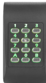
Green backlight Access granted

The MTPADP-RS-MF is equipped with an orange backlight that can be easily disabled if necessary with My WS4. The keypad changes its backlight color when the code or card is presented.