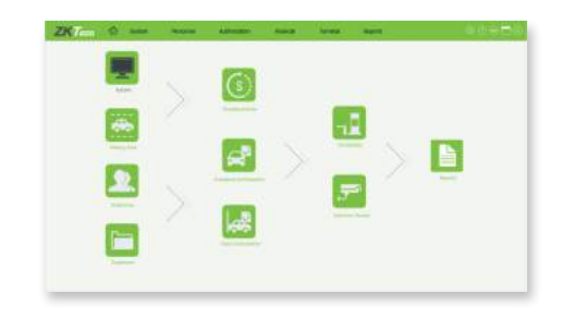
ZKParking & ZKBioSecurity