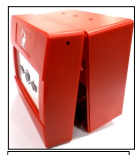
Picture 9 - front device block insertion to its wall mounting back box

In order to complete the installation, the front device block must be securely installed on the wall-fixed back box. In order to perform such task operate as illustrated in picture 9.