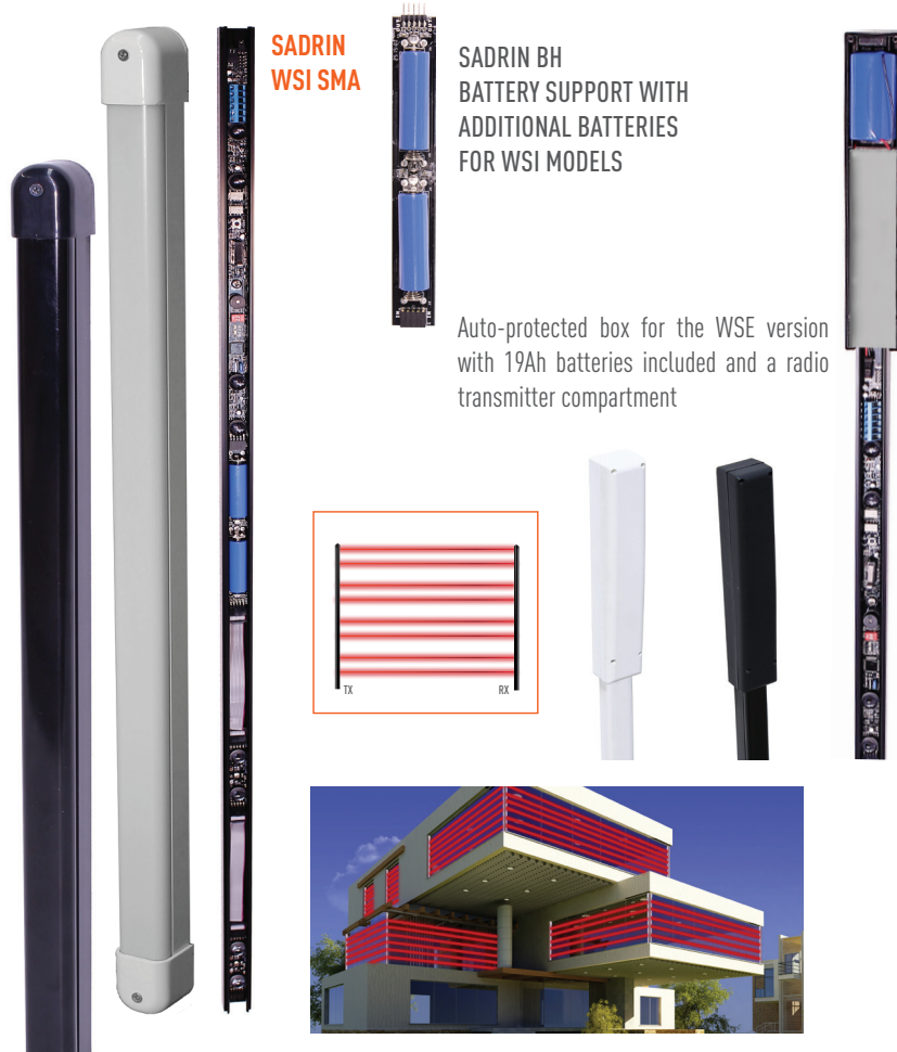
SADRIN WSI SMA